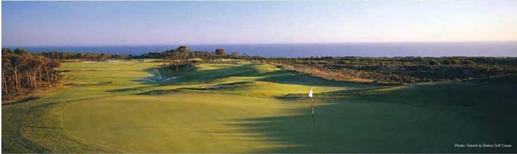
Photo: Estoril & Retiro Golf Course